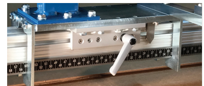
System stabilizes each unit.